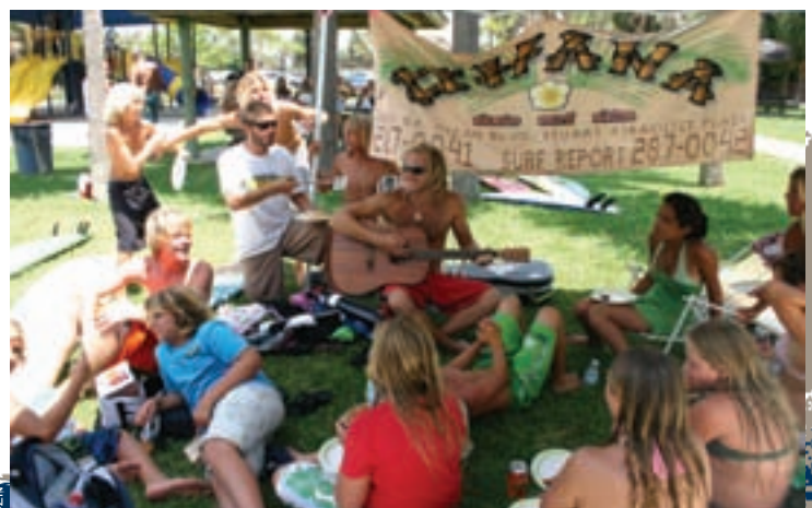
Surfrider Foundation's Outer Banks Chapter poses for a shot.